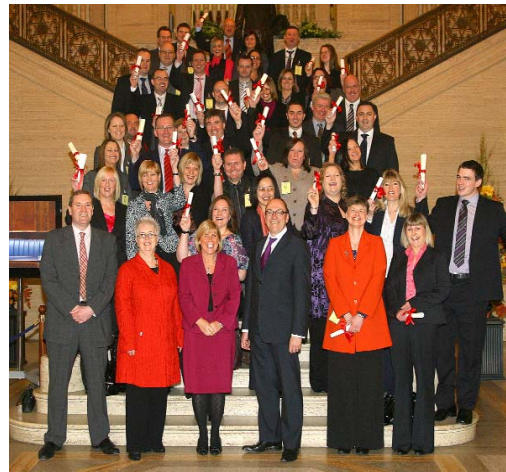
Event officials and students celebrate their success on the steps of the Great Hall, Stormont