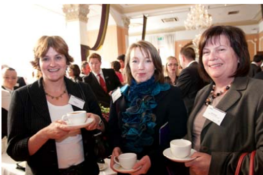
Delegates taking a quick break from conference sessions and visiting the exhibition hall during coffee