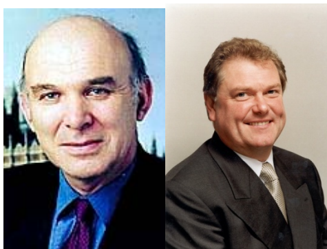
Dr Vince Cable and Lord Digby Jones to address CIPFA Northern Ireland 2009 Conference

As reported in Part 4 the 2009 event was a great success (for full Conference Programme please see Part 11 of this report. Also visit www.cipfa.org.uk/ni/annual_conference.cfm ) and note that plans are already underway for the 2010 conference.