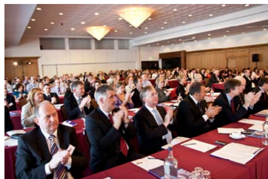
Delegates at the CIPFA Northern Ireland 2009 Conference