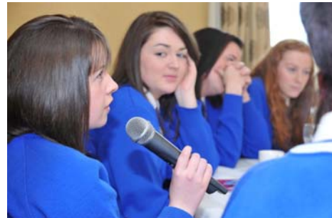
Girls from the Assumption Grammar School, Ballynahinch, grill the panel members