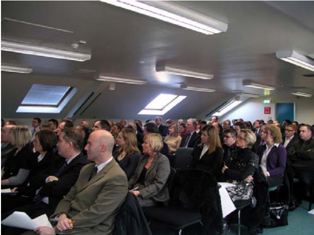
A full house of accountants and auditors